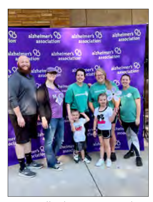
HYP walked at FHSU to raise funds and awareness for the Alzheimer's Association on September 23.